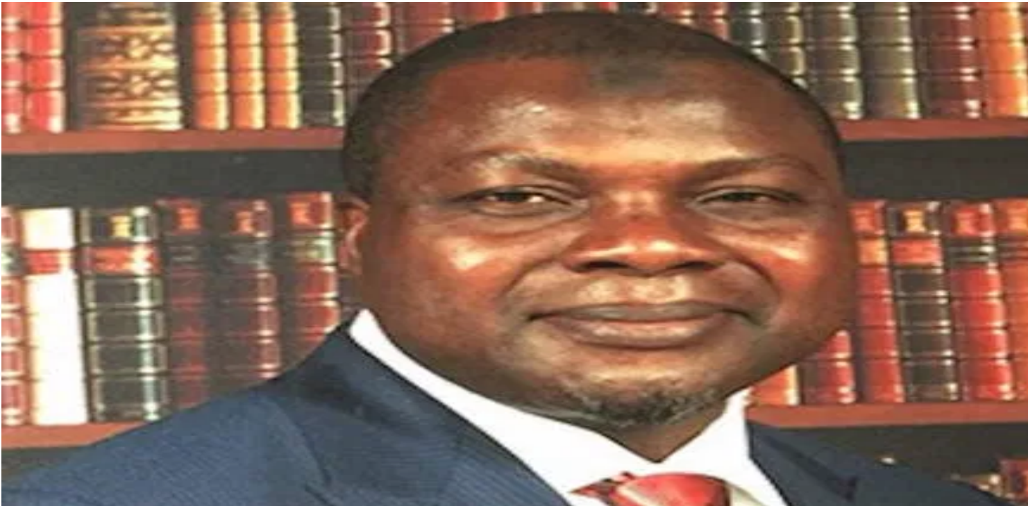
NEW CIS PRESIDENT UNVEILS NEXT LEVEL AGENDA